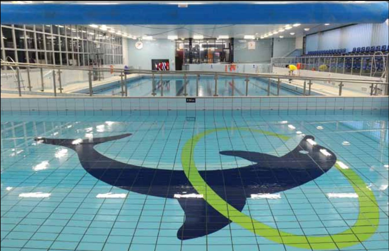
Dolphin feature, Learner Pool