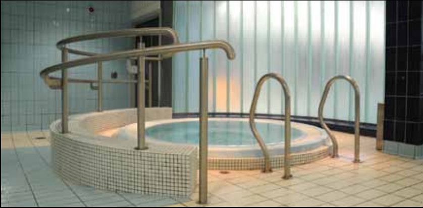
Jacuzzi, Orchard Leisure Centre