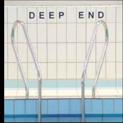
Deep End Markers, 25m Swimming Pool