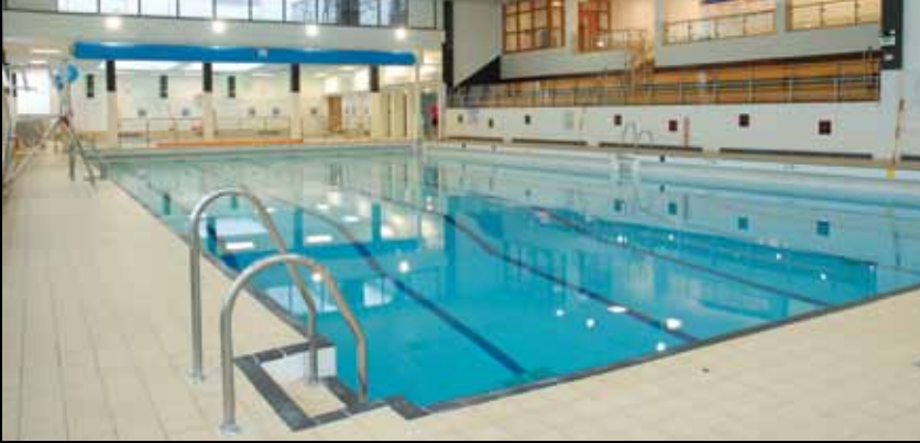
Dungannon Leisure Centre Swimming Pool